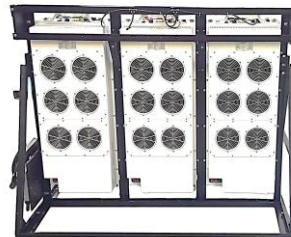
1:2 Redundant Version