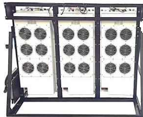
1:2 Redundant Version